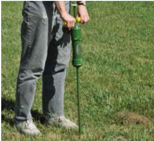
Figure 1. Probing for gopher tunnel.

Step 6: Check traps 24–48 hours later. If no activity, move to new tunnel system.